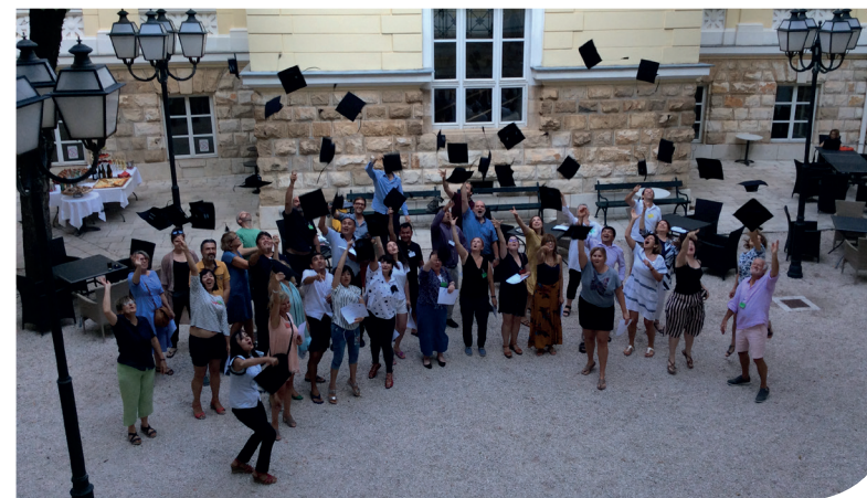
10th UNICA PhD Master Class in Dubrovnik, 1 - 4 September 2019